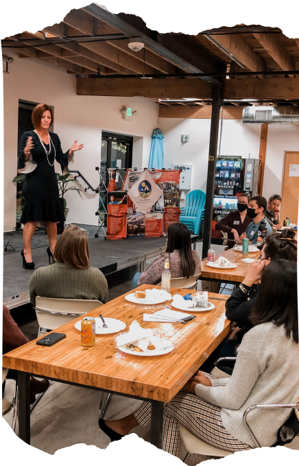
Networking Event, November 2021 at the Posner Center for International Development

The Emerging Leaders Committee (ELC) is actively united in CPHA’s efforts to create the healthiest Colorado by collaborating with students and early careerists. Over the past year, ELC has been wholeheartedly committed to building an engaged community centered on offering valuable opportunities for career development, forming genuine connections, and creating an equipped, robust group. These commitments have driven ELC to a successful year where we offered 7 volunteer and outdoor activities, 2 networking mixers, and 6 skill-building workshops. From October 2021 through August 2022, ELC had over 350 event attendees, of which 2 out of every 7 became CPHA members.