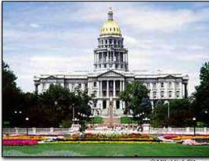
Colorado State Capitol Building